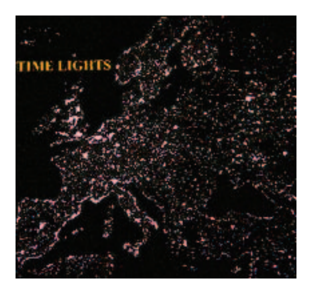
Fig. 2: Europe's built environment is expanding, blocking water- and geochemical cycles and increasing the pressure on the ecological services of the remaining land, already under pressure from intensive agriculture. This result of the current management of soil resources is not easy to reverse. To enhance the economic competitiveness in Europe while maintaining a high quality of life and well-being in a healthy environment, land management has to exploit the natural capacities and ecological services of the soil and water system in a more sustainable way. Research is essential to explore options for sustainable management.

Through sealing alone, Europe loses several square kilometres of fertile land every year (see Fig. 2). These soil losses and soil degradation processes are impairing the quality of air, the quality of water resources (surface and ground water) the production of biomass (including the food chain), the biodiversity and indirectly also human health.