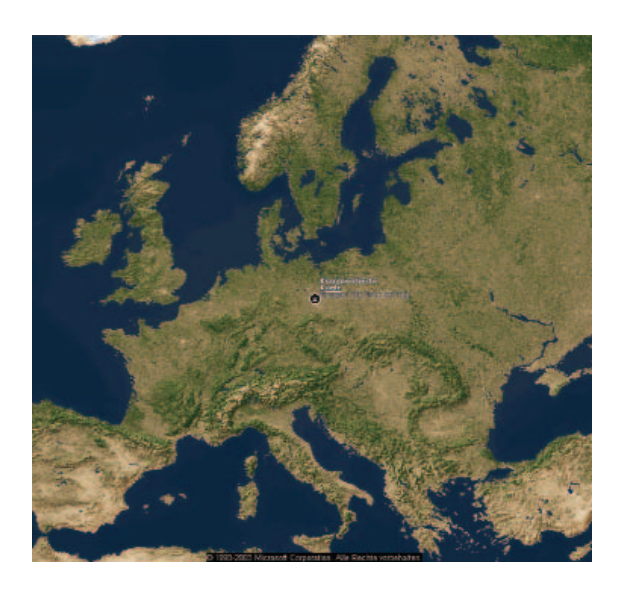
Fig 1: European soil resources. Soils and their different natural qualities are fundamental to land uses and functions in providing ecological services. European soils are under pressure by non-sustainable landuse practices. Understanding the varying properties of the soil (and water) systems in space and time that determine the opportunities for more eco-efficient land uses is essential for future integrated resource management policies.

Soils as a natural resource perform a number of key environmental, social and economic functions. Agriculture and forestry depend on soil for the supply of water and nutrients and for root fixation. Soils perform storage, filtering, buffering and transformation functions, thus playing a central role in the protection of water and the food chain and the exchange of gases with the atmosphere. Moreover, soil is a biological habitat, a gene pool, an element of the landscape and a cultural heritage as well as a provider of raw materials (see Fig. 1).